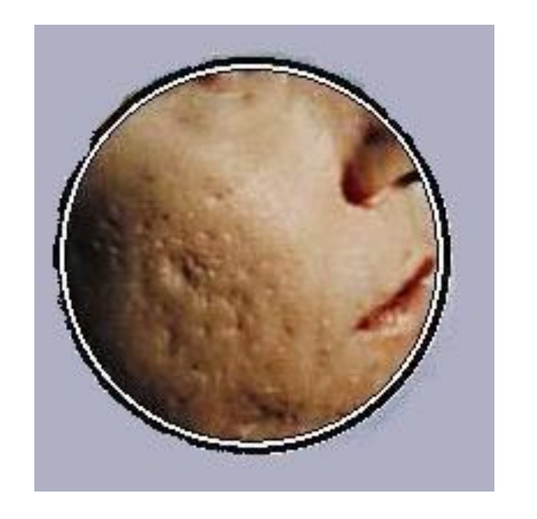
Scaring It is not Inevitable, so reaching to this stage should be avoided by giving an early treatment

" رَبَّنَا ٱغَفِرْ لِي وَلِوَالِدَيَّ وَلِلَمُؤْمِنِينَ يَوْمَ يَقُومُ ٱلْحِسَابُ "